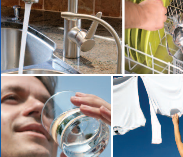
Better Tasting Water