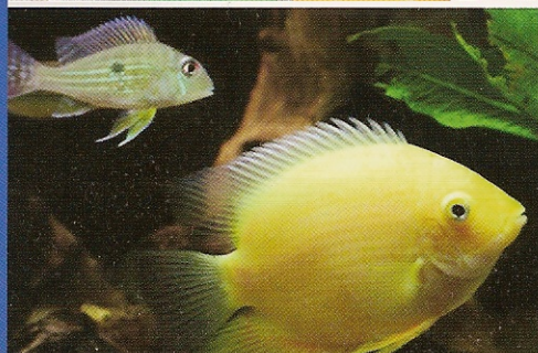
Care for plants and aquariums