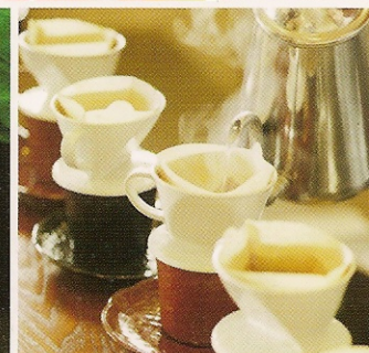
Better tasting beverages